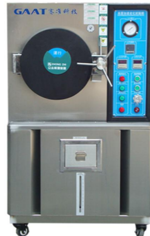
Pressure Cooker Test Chamber