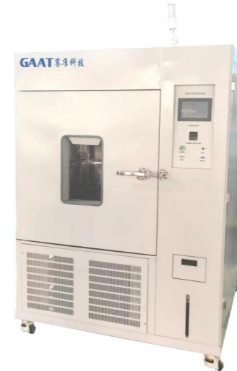
SO 2 Test Chamber