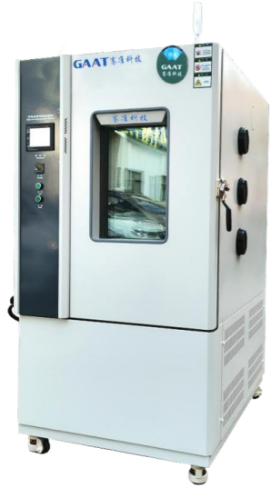
Temperature Cycle Chamber